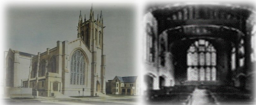
Richardson Memorial Presbyterian Church, Philadelphia