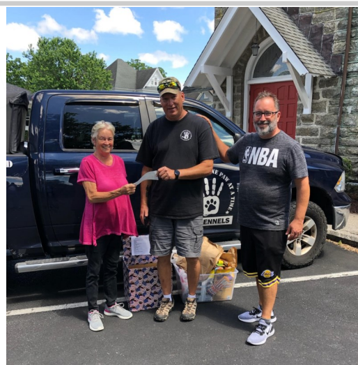
Mission Donation to U.S. Kennels

⇒ S'more Time with Jesus is a church and community outreach night on 2nd and 4th Fridays throughout the summer. This summer our S'more Time with Jesus nights will be VBS style. Each night we will have burgers and hot dogs, bible story, crafts, songs and games. Other churches in our area have been asked to join for a Vacation Bible Summer Camp Out theme. Anyone who would like to help with one night or several nights are invited to come help wherever you feel called!